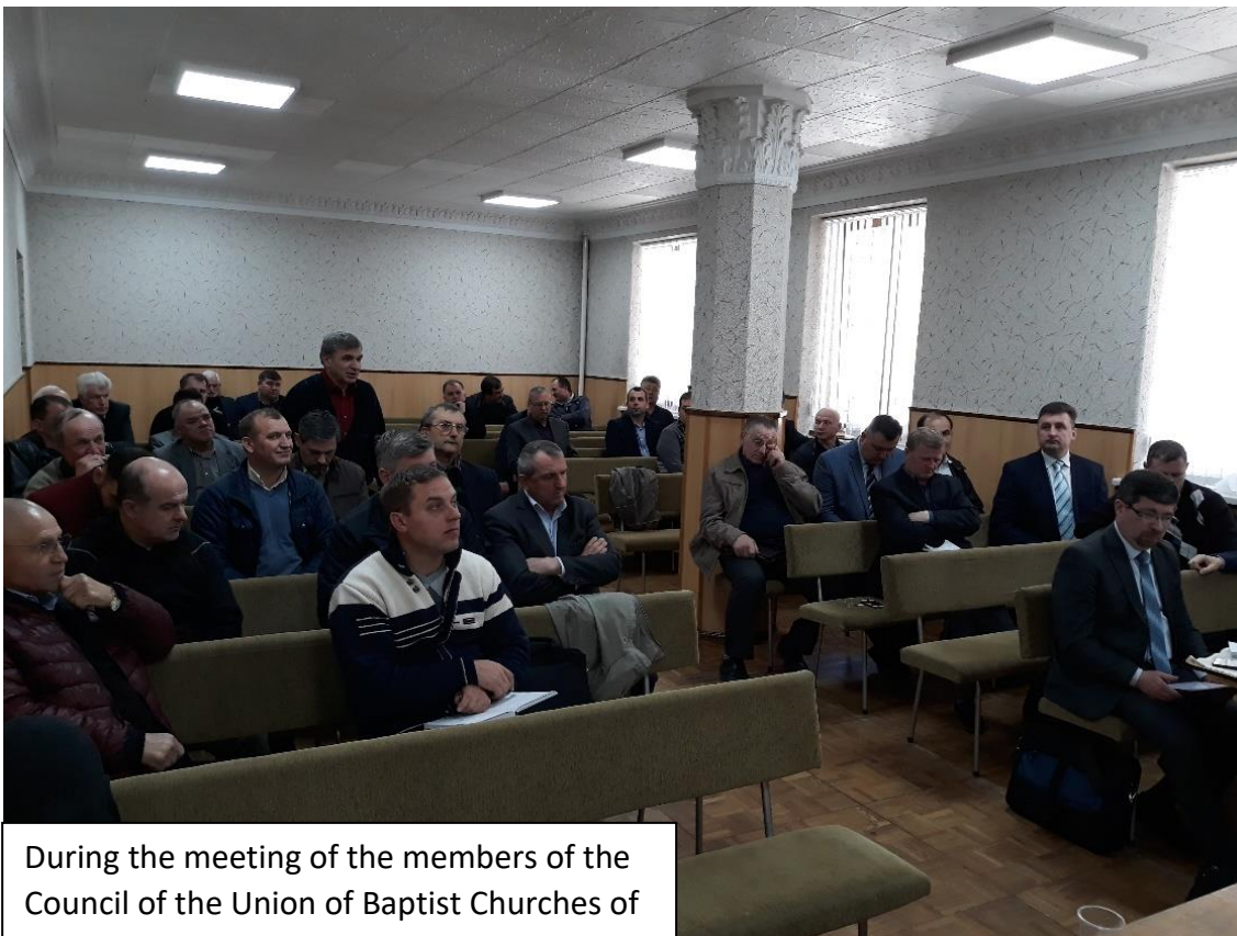
During the meeting of the members of the Council of the Union of Baptist Churches of

Finally, spring has come to Moldova. The locals say that this a “classic” spring is; meaning, it’s what it used to be before the onset of the so-called “global warming.” After the winter cold and snowfall, warming began gradually. And now Moldova is really warm. Most fruit trees have bloomed and there are flowers growing everywhere. The smell of lilacs fills the air with fragrance. Great time!