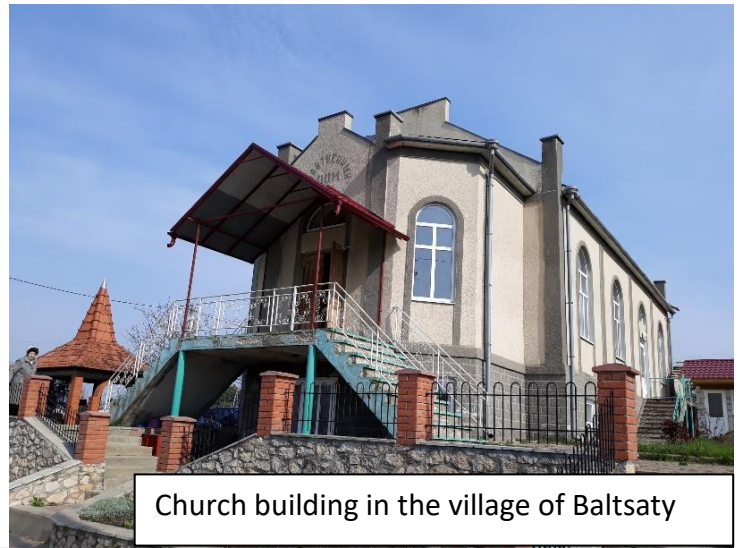
Church building in the village of Baltsaty

On Sunday, April 21 , we visited a church in the village of Baltsaty, which is located near Chisinau. Considering that in Moldova, as in Ukraine and Russia, the Easter holiday was celebrated this year one week later than in America and Western Europe, the holiday of the triumphal entry of Jesus Christ into Jerusalem was celebrated in Moldova, on April 21st. Thus, this year we had the opportunity to celebrate this holiday twice—once in Latvia, another time in Moldova 😊.