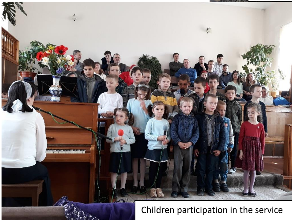
Children participation in the service

The ministry in the church we attended was festive. The choir sang very nicely. Although the congregation is small - about 60 members, its singing ministry is at a high level. Not only did young people and children participate in the program of the service, but also people in their older years. One of them, a woman older than 80 years, recited by heart a long poem about the holiday. She did it very beautifully. When I asked the local brothers who this