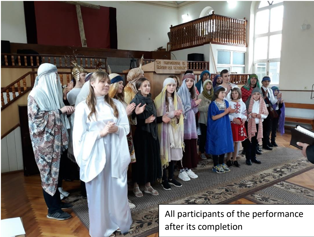
All participants of the performance after its completion

For students and university professors, the end of April marks the beginning of the closing period in the spring semester. After the current week of Easter holidays, another couple of weeks of studying will pass. After that, there will be exams, and the semester will end at the end of May. Time passed quickly. It is sad to know that in a short time we will part with those students who finish their studies this year. However, this is the meaning of our ministry at the university - to give students the necessary knowledge and skills for work and ministry and let them go into an independent life.