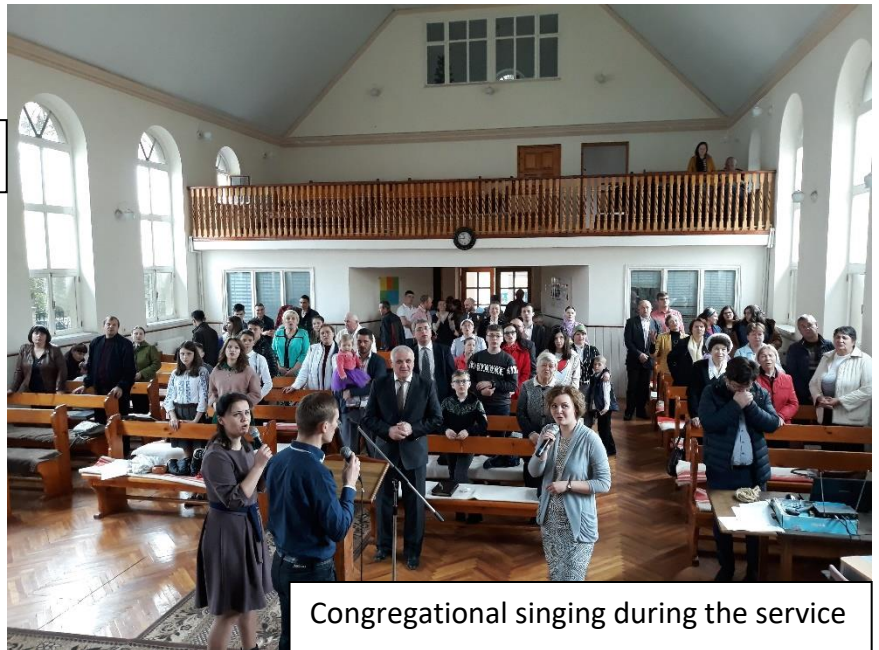
Congregational singing during the service

The performance was very well prepared and executed. It was obvious that in this small church - about 60 members, there are many talented people. At the conclusion of the festive ministry I was given the opportunity to give an Easter sermon.