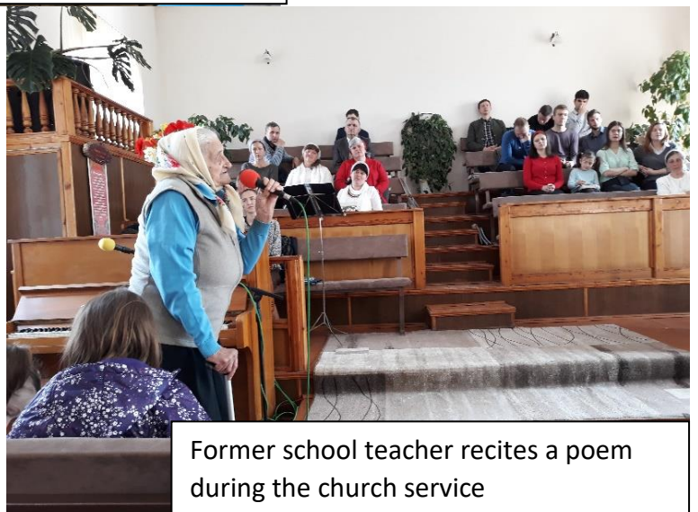
Former school teacher recites a poem during the church service

I was given the opportunity in this service to deliver a sermon.