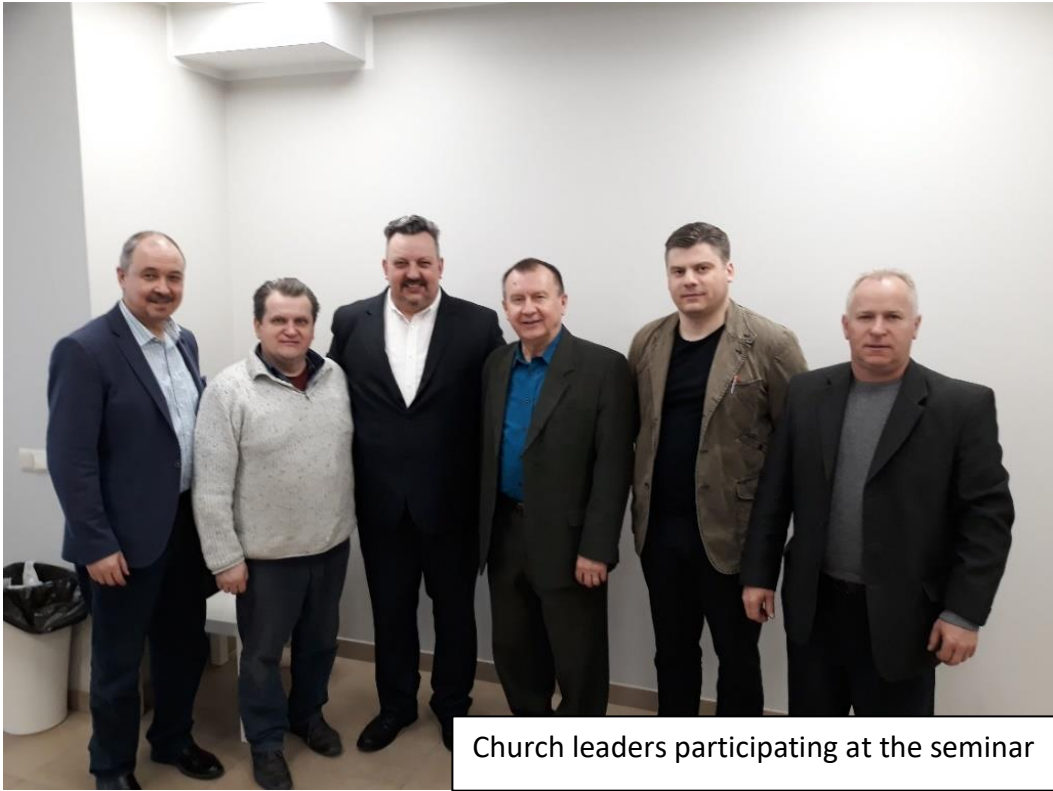
Church leaders participating at the seminar