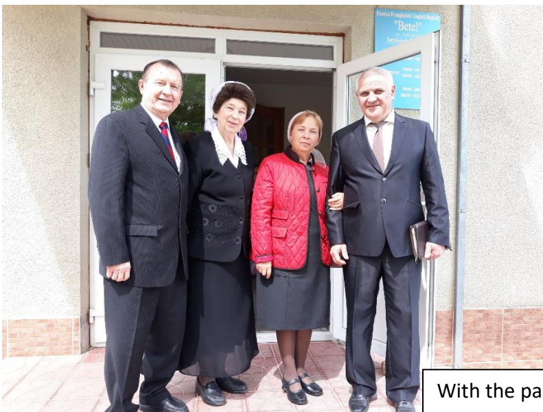
With the pastor and his wife after the service