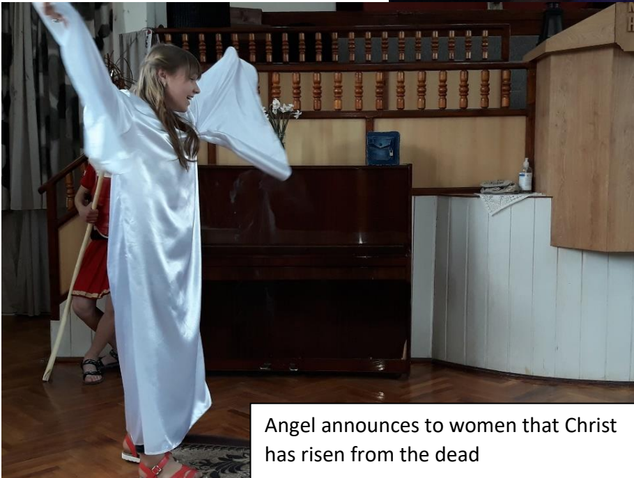
Angel announces to women that Christ has risen from the dead