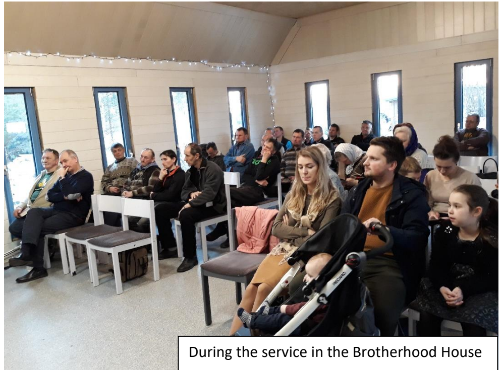
During the service in the Brotherhood House