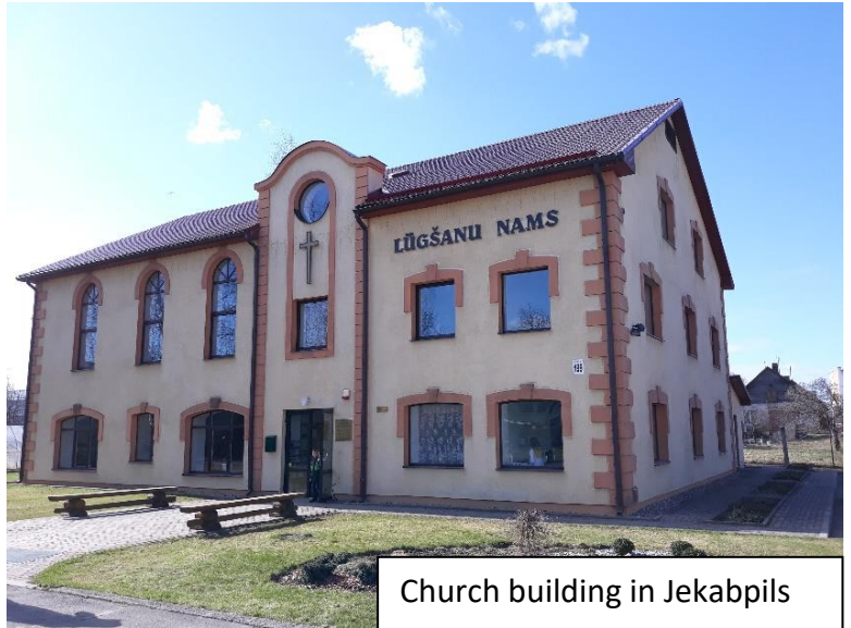
Church building in Jekabpils

On Sunday, April 14th , we visited the church in city of Jekabpils, which is located 120 km from Riga. On this day in the churches of Latvia remembered the triumphal entry of Jesus Christ into Jerusalem. We were pleased to celebrate this holiday with the members of this church. I took part in the service by preaching the Word of God.