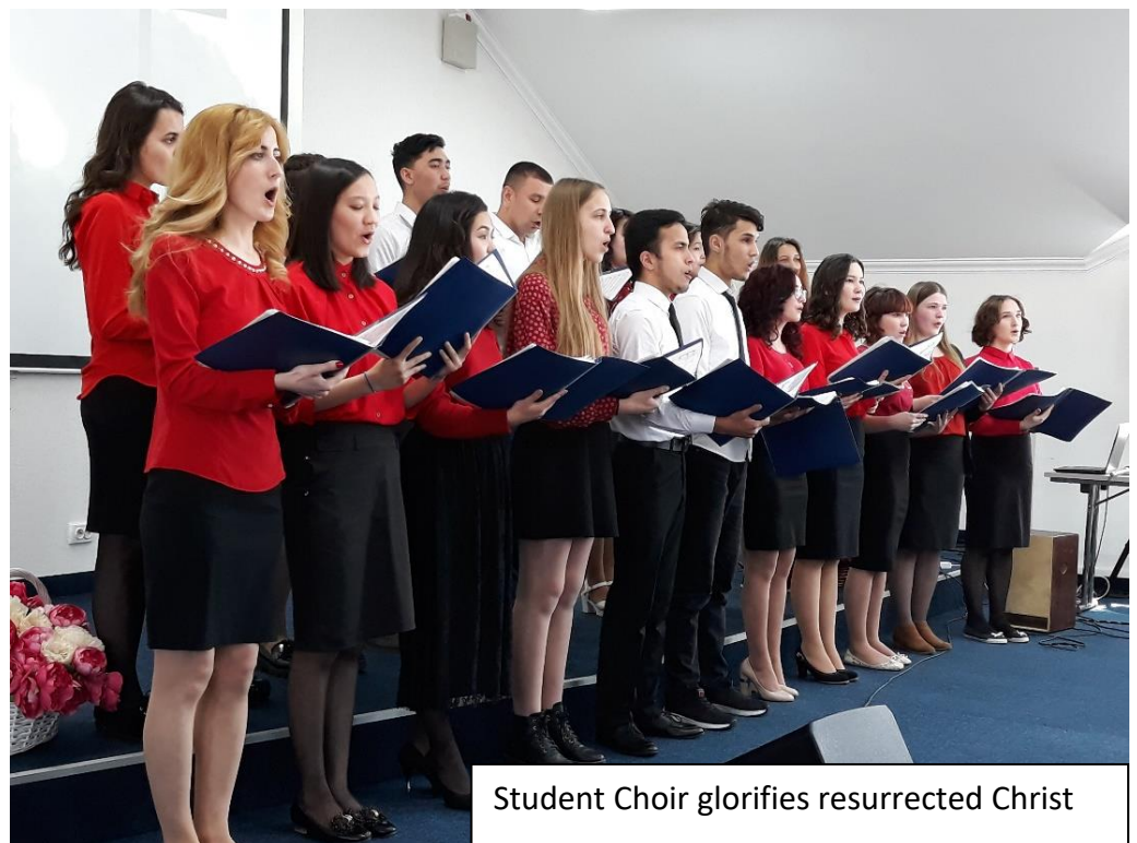
Student Choir glorifies resurrected Christ

On April 25 , on Thursday, at 12:00 pm, a festive service dedicated to the Easter holiday took place at our university. The student choir sang very nicely. It was consisting of representatives from different countries - Kazakhstan, Uzbekistan, Tajikistan, etc. It was nice to see such an "international" band glorifying the Golgotha passion of Christ, which made such a unity of people of different nationalities possible.