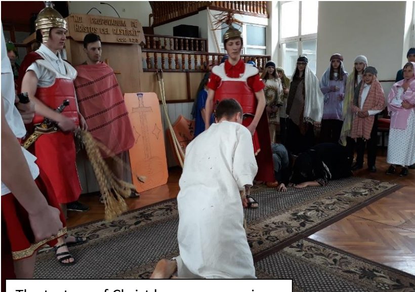
The torture of Christ by roman warriors